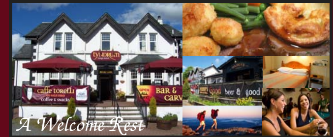
A Welcome Rest