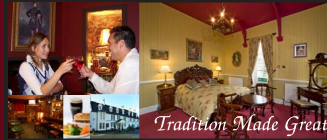
Tradition Made Great