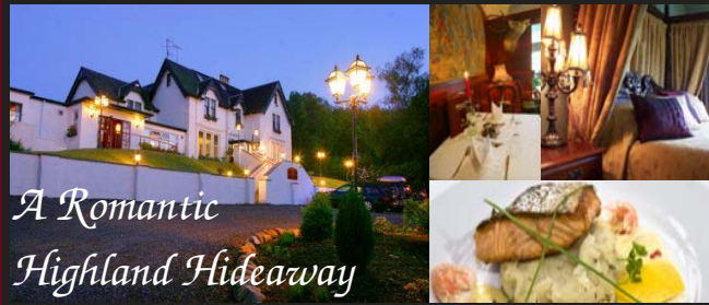
A Romantic Highland Hideaway